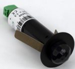
Black KNX Motivity Ceiling