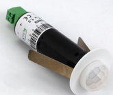
White KNX Motivity Ceiling