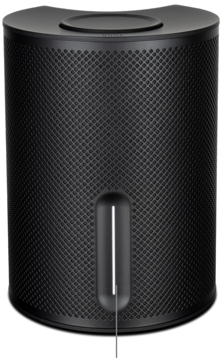
LED STATUS INDICATOR